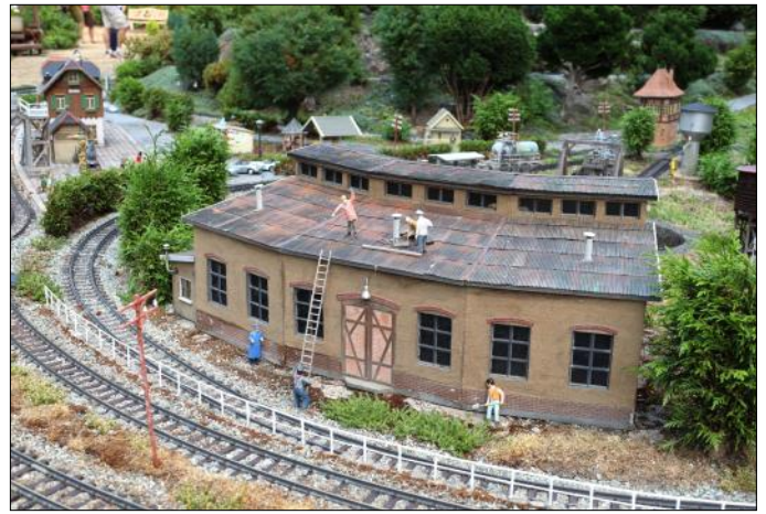
Workers constructing new buildings