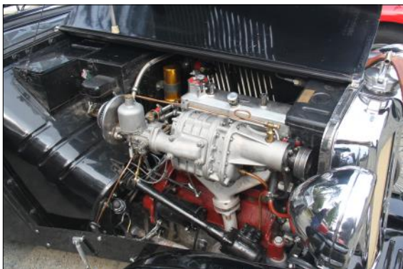
Marshall blower on a TC.

The next day we drove through Cowichan Bay and stopped for an impromptu car show of our 12 marvels which drew quite the crowd. We had a J2, TC's, TD's and TF's in the gathering. We then wended our way to the Fox and Hounds, Ladysmith, for more food! Everyone parted in good cheer and I was left somewhat smug as I did not have to do battle with BC Ferries.