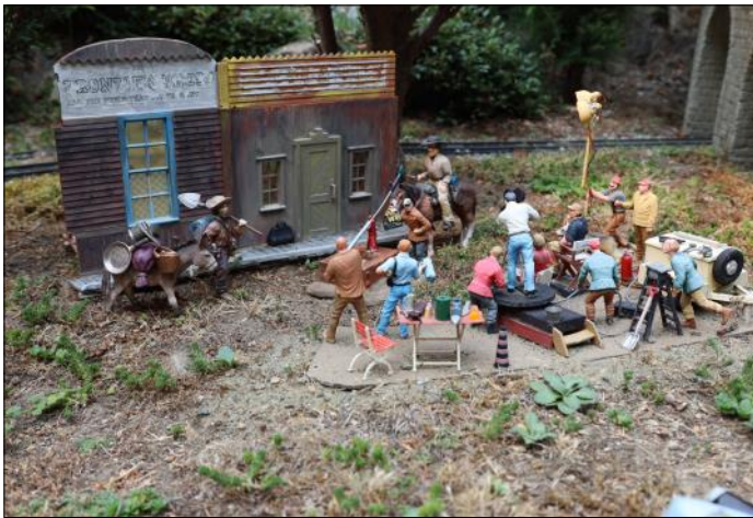
A movie crew hard at work