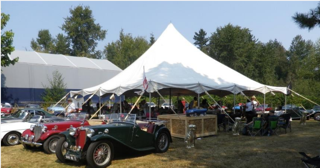
This photo is taken at the International Movie Services

The Abbotsford BC Car Show which I recently attended during Heritage Weekend in Langley. This is an annual event staged by the combined Canadian XK Jaguar Register and Canadian Classic MG Club, and I must say it was very enjoyable.