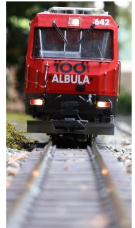
Keep an eye on the tracks