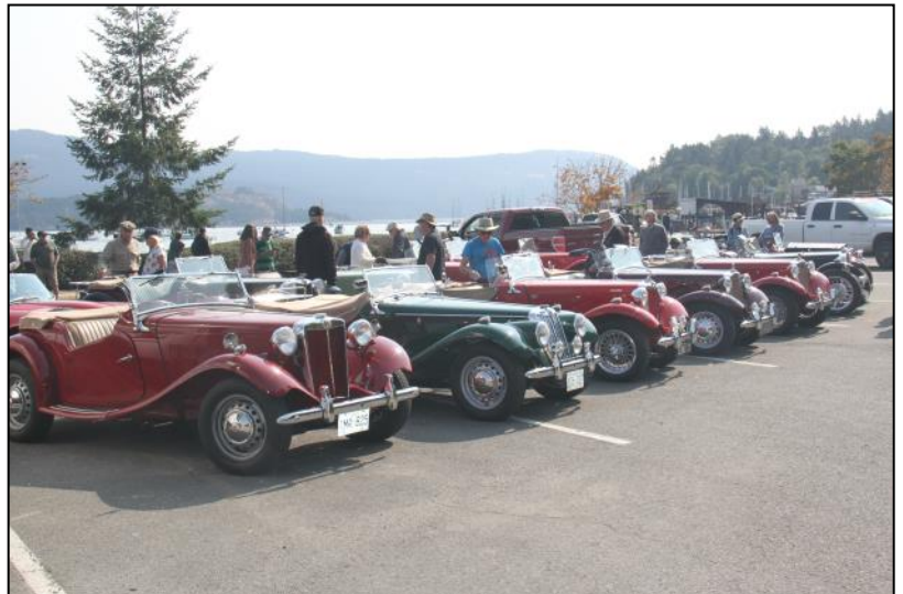
12 cars at Cow Bay (only part of group can be seen)

August 23 rd revealed a band of T Type enthusiasts thundering off their respective ferries to meet at the Crow and Gate pub for lunch. Three and a half hours later after considerable banter mostly outside in the car park we wended our way to their hotel in Chemainus.